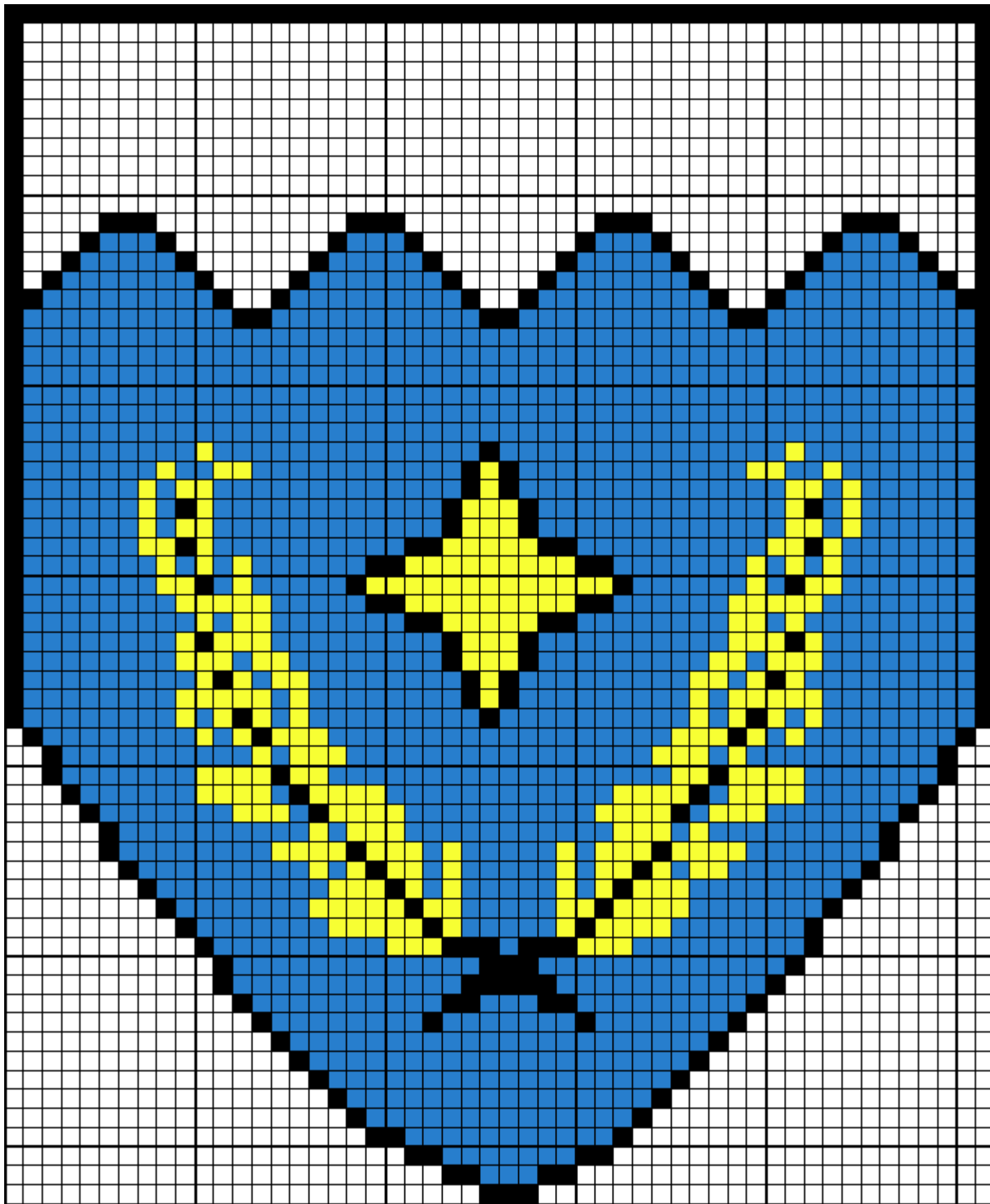
Title: The Barony of White Waters Author: Middle Kingdom Cloak Project Grid Size: 52 W x 63 H Fabric: 14 stitches per inch Design Area: 3.71" H x 4.5" W