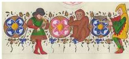
Illumination by Cerridwen verch Ioreword