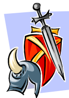
Heavy Armor Fighting