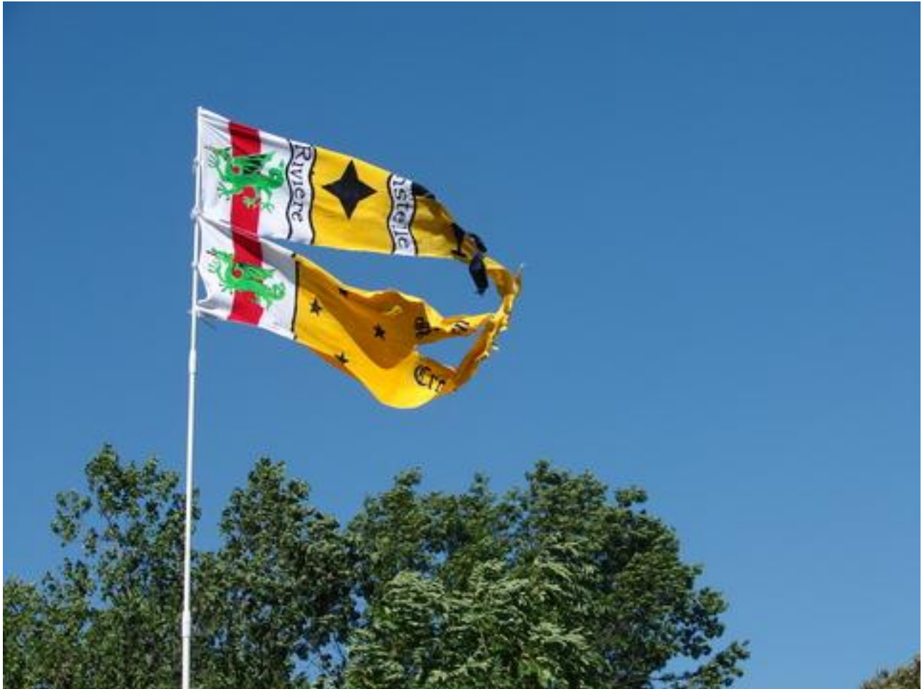
Photo of the Riviere Constelle and Southern Cross Standards

-- July, August & September 2009 -- The Newsletter of Riviere Constelle Issue #82 Free!