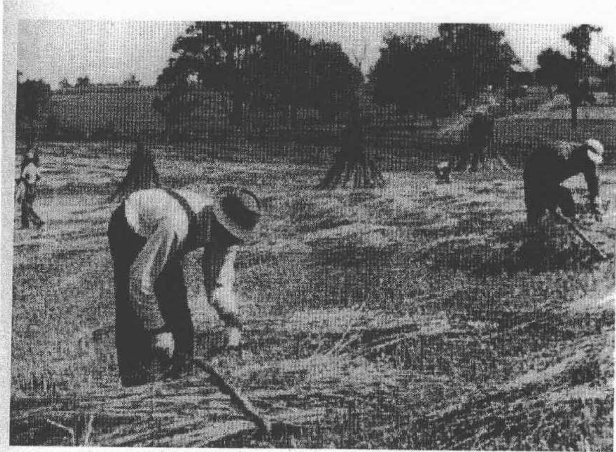
Gathering retted hemp stalks to be placed in vertical hemp shocks.